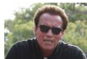
Stars Working Out