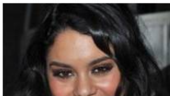
Vanessa Hudgens Gets Some Ink in NYC