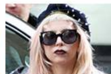
Hit Or Miss Fashion