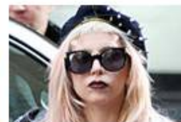
Hit Or Miss Fashion