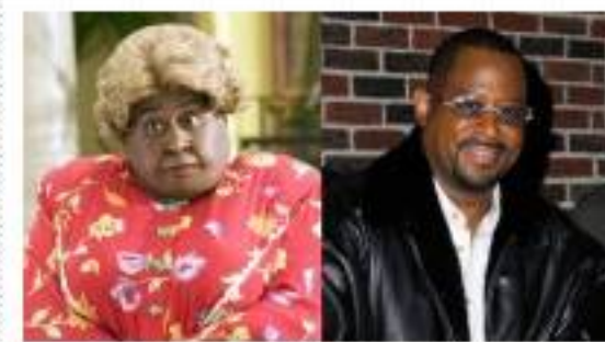
Martin Lawrence on His Return to Comedy