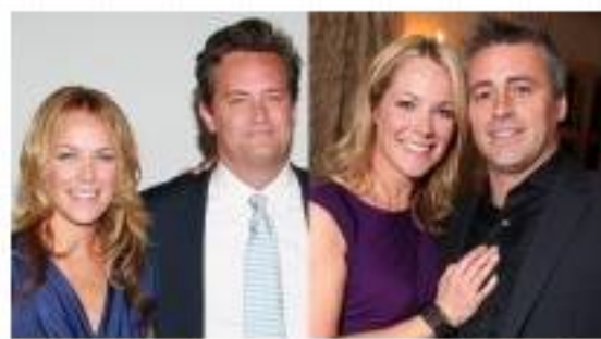
Perry's Girlfriend By Day, LeBlanc's By Night