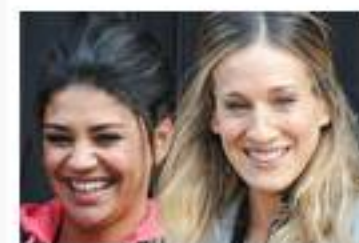
Stars On Set